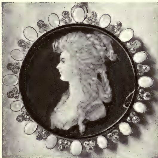
PORTRAIT OF A LADY (NAME UNKNOWN) BY PIERRE PASQUIER (1786)